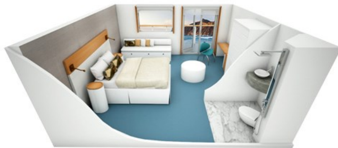
■ Balcony Suite Plus

This is our most comfortable cabin, including panoramic windows and a large balcony.