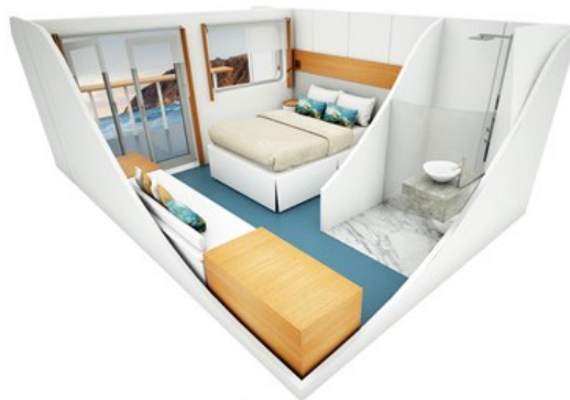
■ Balcony Suite

They include panoramic windows and a balcony.