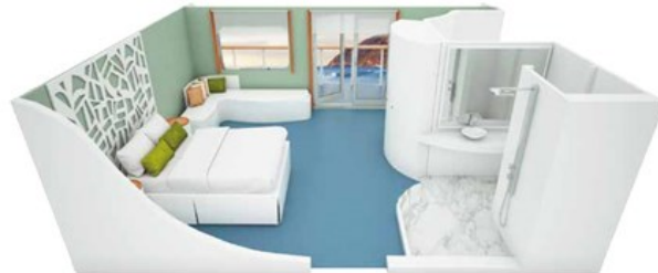
LEGEND BALCONY SUITE

Each cabin includes a private bathroom (with hair dryer & toiletries), phone (local calls only), safe deposit box, air conditioning and a TV. Voltage is set for 110 volts/60 Hz. There is Wi-Fi access in the lounge area.