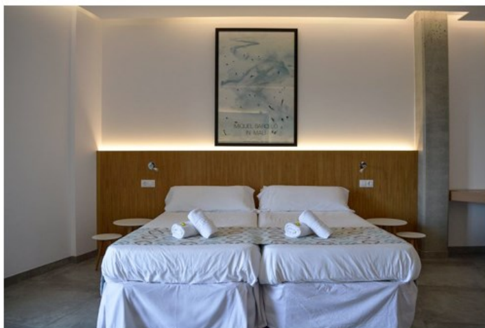
Superior room (29 m 2 + balcony) - Upgrade - 6 rooms total - Can accommodate up to 4 people (additional fee for extra beds)

Our standard rooms have been upgraded recently. They combine a rustic aesthetic with modern comforts, remaining true to the authentic Majorcan style. They are fully equipped with satellite TV, telephone, Wi-Fi, climate control, a water kettle, safety deposit box, bathroom with bathtub, towels and amenities.