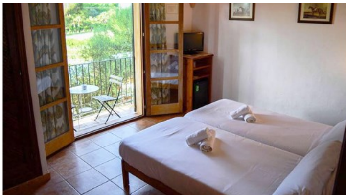
Standard room - 6 rooms total - Single, twin, or double occupancy

Our standard rooms have been upgraded recently. They combine a rustic aesthetic with modern comforts, remaining true to the authentic Majorcan style. They are fully equipped with satellite TV, telephone, Wi-Fi, climate control, a water kettle, safety deposit box, bathroom with bathtub, towels and amenities.