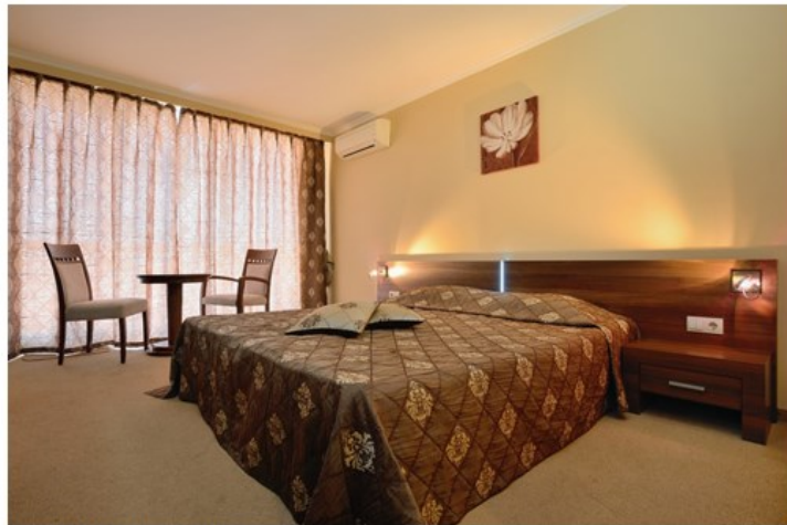
SPA Hotel Hello in Hisarya

Night 6: Winery & Spa complex in Starosel